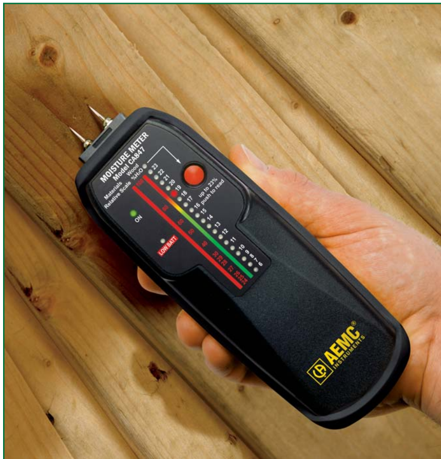
Measure the moisture levels in a variety of construction materials with the Moisture Meter Model CA847.