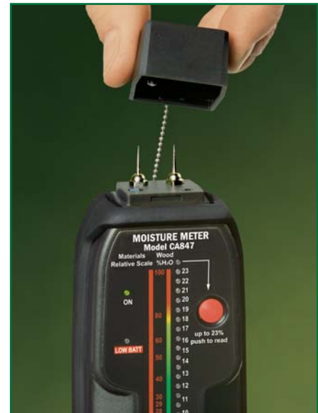
Protective cover also acts as power switch – remove cover to turn instrument on; replace cover to turn instrument off.