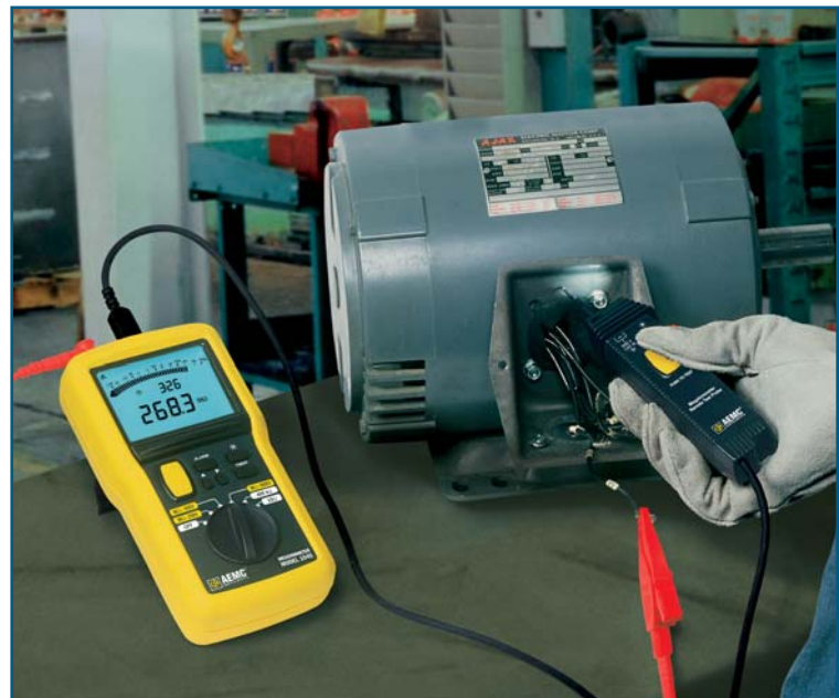
Remote probe used with Model 1045 to initiate a test at the motor. Target light provides good visibility of test area.